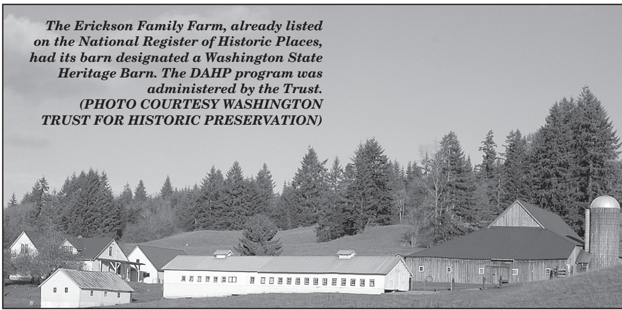
The Erickson Family Farm, already listed on the National Register of Historic Places, had its barn designated a Washington State Heritage Barn. The DAHP program was administered by the Trust.

I think it's real important to make the case -- you see it nationally and I think other organizations like ours that are statewide organizations in other areas of the country are making this case now more than ever -- in addition to the economic development piece, preservation is sustainable. It's a green practice from the standpoint of if you are preserving a building, you're not sending things to the landfill. There are certainly some places in terms of energy efficiency that historic buildings need to improve on. But you don't do that by knocking a building down and building a brand-new LEED-certified energy efficient building. While that's great, there's still a huge amount of energy that's lost by taking down that historic building.