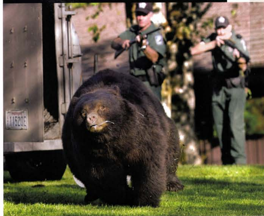
A black bear, caught by WDFW officials, is released near Palmer (about 30 miles southeast of Seattle). One wildlife official has a gun with non-lethal ammunition to frighten the bear; the other has a lethal rifle—just in case